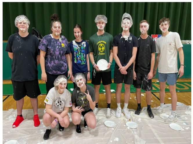
Members of the Senior Class who volunteered to get a pie in the face