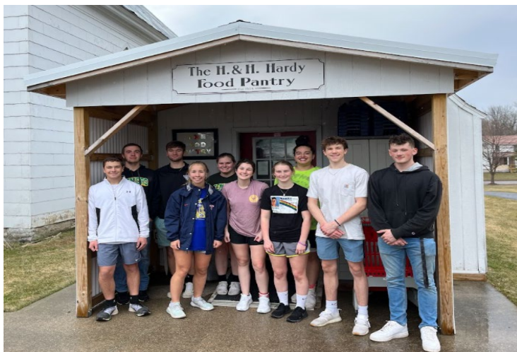
Members of the Senior Class who delivered donations to the food pantry.

A huge thank you to all who participated in this great service project to benefit our community!