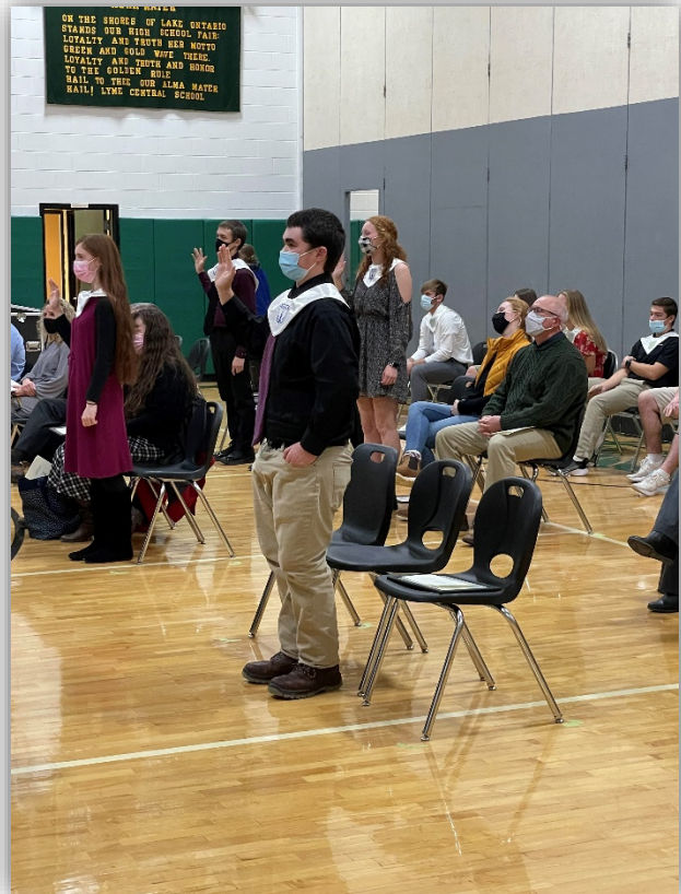
2022 NHS Induction Ceremony